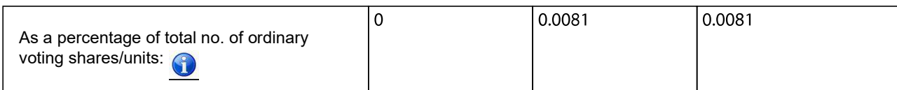
Table 3. Change in respect of rights/options/warrants over shares/units of Listed Issuer